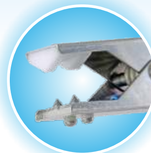
Tungsten Carbide Tips