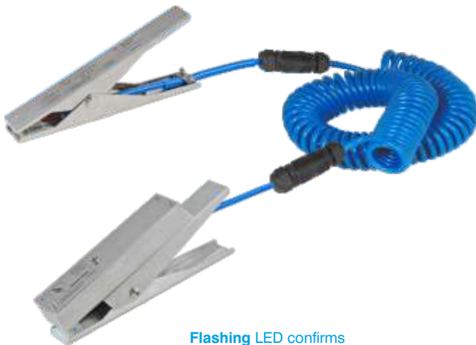
Flashing LED confirms healthy Bond connection