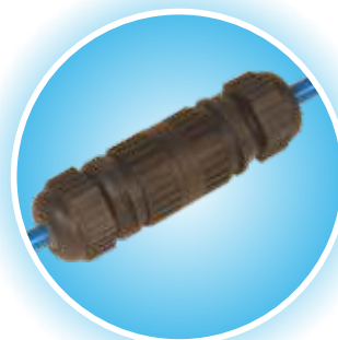
In-Line Quick Connect