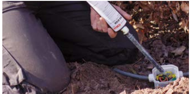
Quick and easy filling with the AMX Resin injection system.